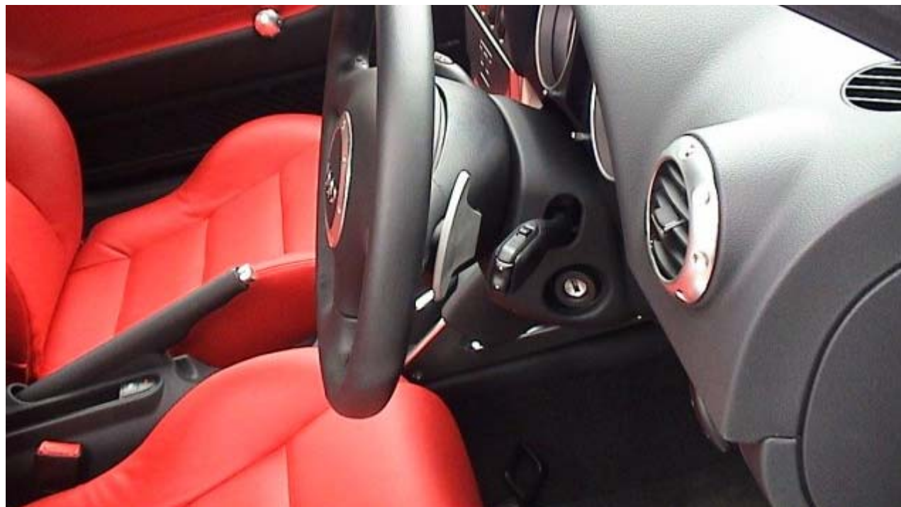
19. A couple of ANT's pictures (hope you don't mind!):