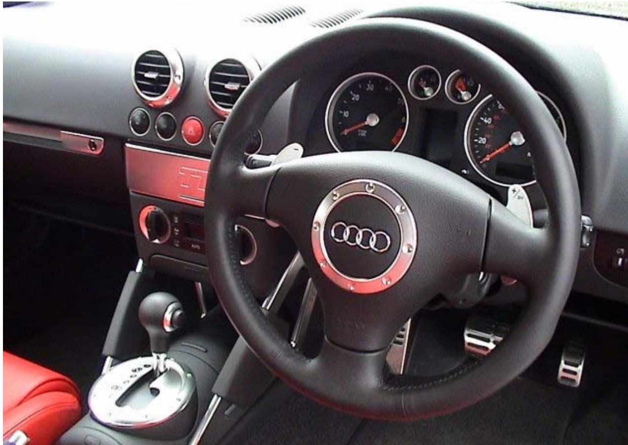
18. View from the side: