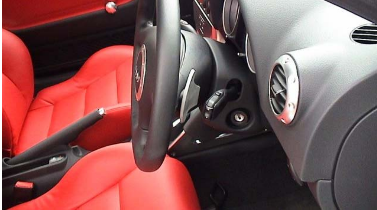
19. A couple of ANT's pictures (hope you don't mind!):